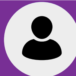
COUNCILLOR VACANCY Ketley Ward