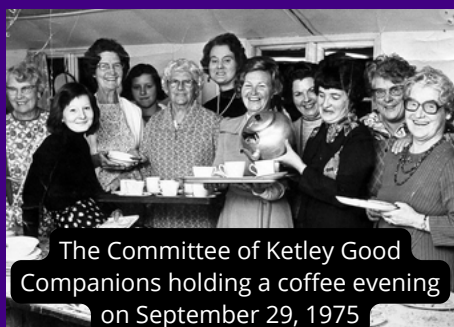
The Committee of Ketley Good Companions holding a coffee evening on September 29, 1975

Ketley Coffee Club (over 50's) meet the second and fourth Thursday of each month 1 pm – 3 pm. Various activities, speakers, and the occasional trip out. Tea/Coffee and biscuits is served each session. New members welcome.